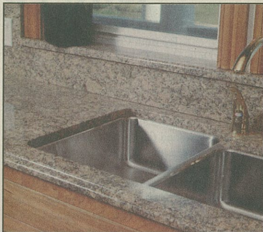
Granite countertops are known for their durability and scratch-resistant properties.

dards and have graced many kitchens and fireplaces. Discriminating customers can choose between Uba Tuba, Verdi Butterfly and Pocono Green. The greens are described as being rich in color with gold content.